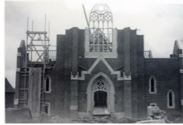
photo: November 27, 1948, almost ready for the roof! In the meantime, church services were being held in the Kingsway Theatre.